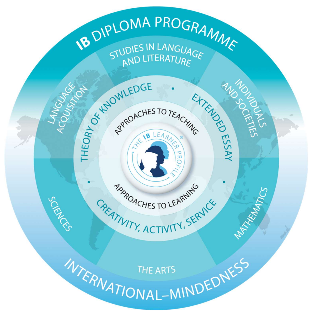
Figure 1 Diploma Programme model

The course is presented as six academic areas enclosing a central core (see figure 1). It encourages the concurrent study of a broad range of academic areas. Students study two modern languages (or a modern language and a classical language), a humanities or social science subject, an experimental science, mathematics and one of the creative arts. It is this comprehensive range of subjects that makes the Diploma Programme a demanding course of study designed to prepare students effectively for university entrance. In each of the academic areas students have flexibility in making their choices, which means they can choose subjects that particularly interest them and that they may wish to study further at university.