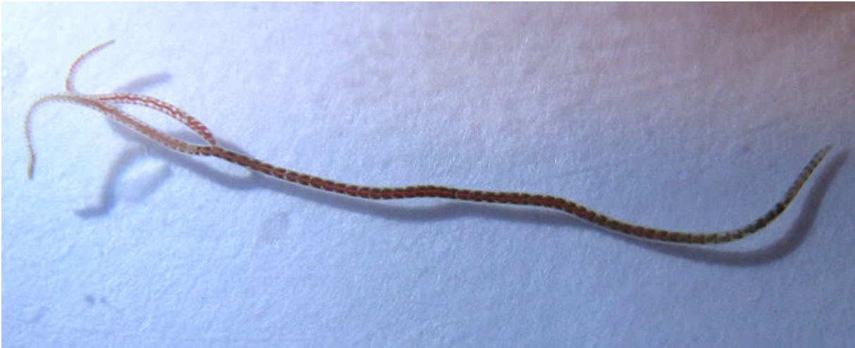
Image courtesy of Dvortygirl. Licensed under Creative Commons Attribution-Share Alike 3.0 Unported license. Reused and distributed under conditions found at: https://creativecommons.org/licenses/by-sa/3.0/deed.en

The blackworm ( Lumbriculus variegatus ) is a species of worm native to North America and Europe. Their habitat includes marshes, swamps and ponds and they are a popular food source for fish kept in aquariums. Blackworms have a very unique way of reproducing, the segments that make up its body are able to regenerate into a complete individual on its own. Sexual reproduction is very rare in these worms.