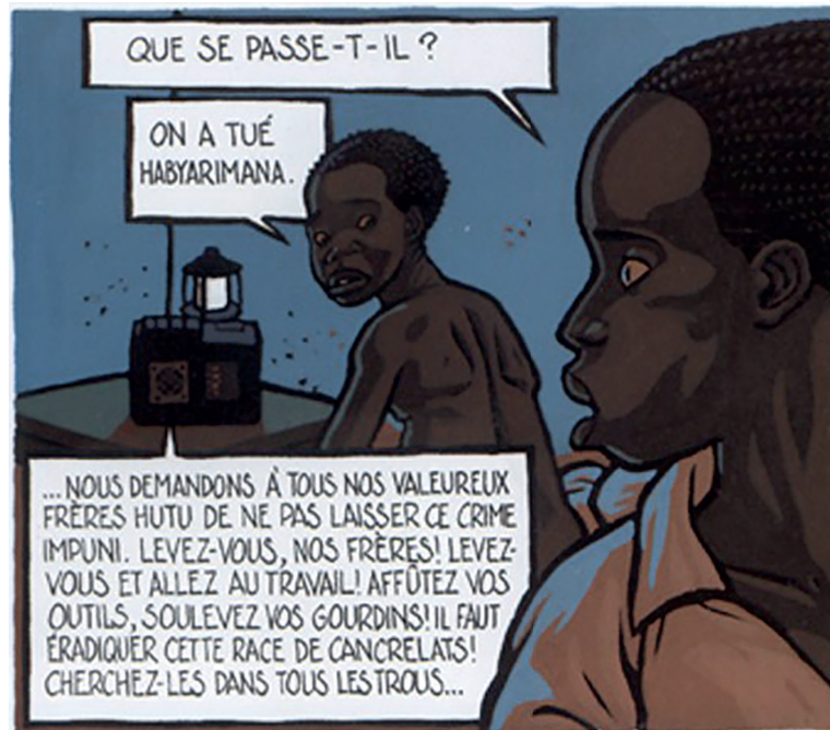
[Source: Deogratias - A Tale of Rwanda , © DUPUIS 2000 by Stassen, www.dupuis.com. All rights reserved]

Jean-Philippe Stassen, an author and illustrator, depicts two children listening to news of Habyarimana's death in the graphic novel Déogratias (2000). The French wording in the captions is: "What is going on?"; "Habyarimana has been killed"; "...we ask our brave Hutu brothers not to let the crime go unpunished. Rise up brothers! Rise up and go to work! Sharpen your tools and raise your clubs! We need to eradicate this race of cockroaches! Look for them in every hole..."