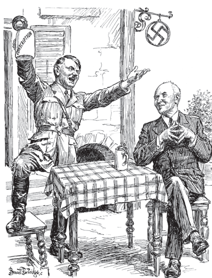
PROSIT! HERR HITLER. "THE MORE WE ARM TOGETHER THE PEACEFULLER WE'LL BE!" SIR JOHN SIMON. "WELL—ER—UP TO A CERTAIN POINT—AND IN CERTAIN CASES—PROVISIONALLY—PERHAPS."

Source J Bernard Partridge, a cartoonist, depicts Adolf Hitler and John Simon in the cartoon “Prosit!” [Cheers!] in the British satirical magazine Punch (27 March 1935). The wording on the tankard is “Conscription” and in the caption it is: Herr Hitler: “The more we arm together the peacefuller [more peaceful] we’ll be!” Sir John Simon: “Well—er—up to a certain point—and in certain cases—provisionally—perhaps.”