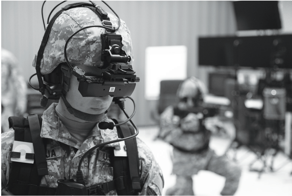
Figure 2: Simulation-based training

Each soldier is also provided with documentation that explains how to use the simulator.