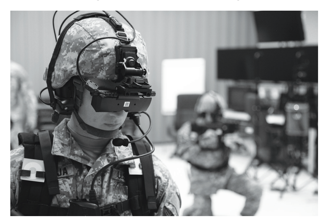
Figure 2: Simulation-based training

Each soldier is also provided with documentation that explains how to use the simulator.