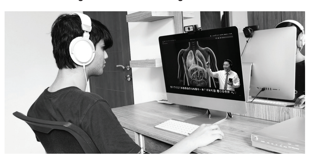
Figure 1: A virtual learning environment

Each university lecturer records their lectures and transfers them to the cloud for remote access by the students.