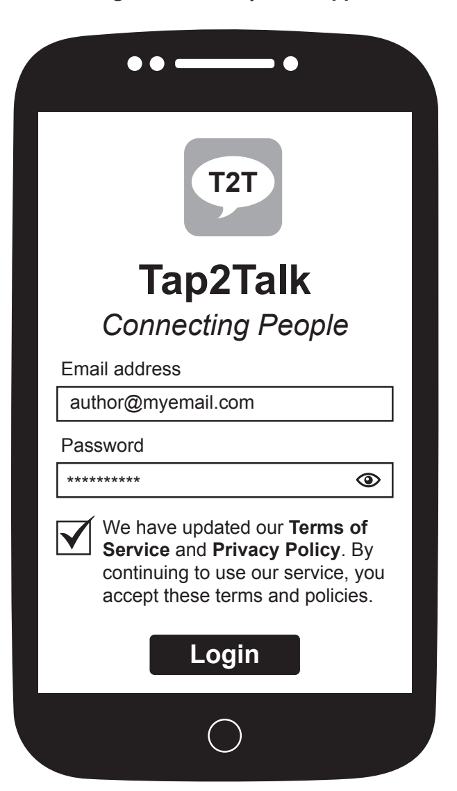
Figure 3: The Tap2Talk app

Tap2Talk frequently reviews and updates its terms of service and privacy policy. To continue to use Tap2Talk services, users must agree to the changes (see Figure 3 ).