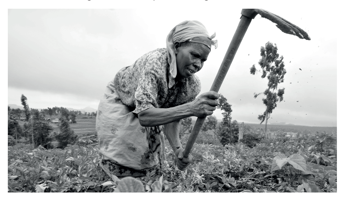
Figure 3: An example of farming in East Africa

A government in East Africa is using the expertise of scientists at a university in the region to promote the culture of smart farming and increase the productivity of farmers (see Figure 3 ).