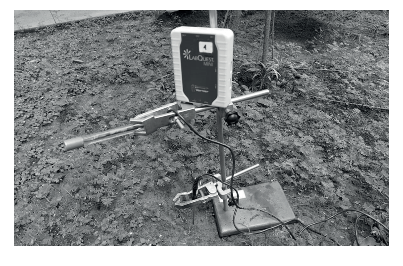
Figure 4: Example of a data logger

The new smart farming system uses a mobile app<sup>1</sup> that connects to a data logger<sup>2</sup> using Bluetooth technology (see Figure 4 ).