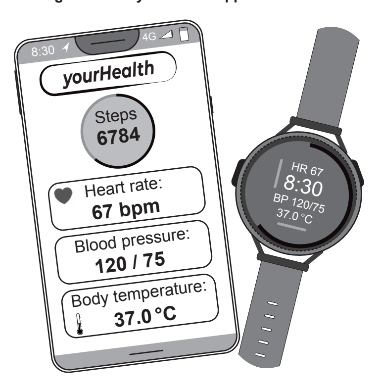
Figure 1: The yourHealth app and smartwatch

Many people use smartwatches to monitor their vital signs and manage their health. Information such as heart rate, blood pressure and body temperature can be obtained from an app* like yourHealth on a smartwatch.