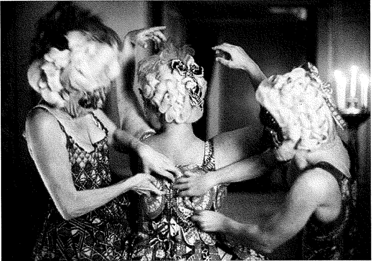
Un Ballo in Maschera (A Masked Ball), 2004, color digital video, 32-minute loop.

his signature Dutch wax fabric, Yinka Shonibare is able to weave an African touch into his