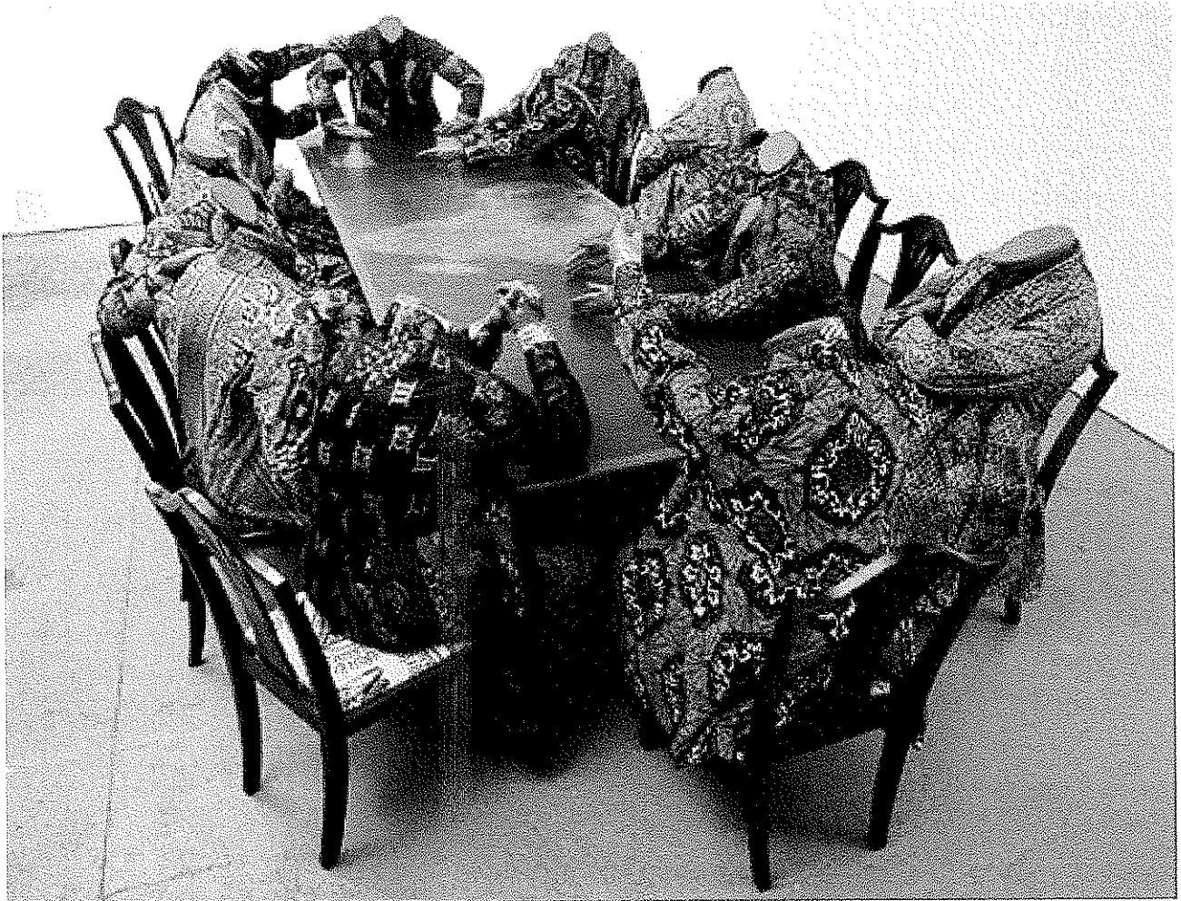
Scramble for Africa, 2003, 14 figures, 14 chairs and table, mixed media, 52x192 x 110". Images courtesy of the artist, James Cohan Gallery, New York, and Stephen Friedman Gallery, London.

school studies he contracted a virus that left him paralyzed and he still remains partially disabled 7 .