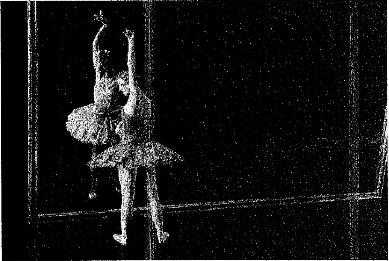
Odile and Odette , 2005, color film.

express an African facet. "I tried to go beyond what would be expected of somebody of African origin and I thought, I've never done a ballet, so why not?" By producing a ballet production, Yinka Shonibare would be appealing to a Western crowd that would normally not be attracted to an African celebration. This points out another key role of art - unification. Art in a globalized world is now able to attract viewers from various backgrounds and ethnicity; it is no longer confined to a region, an area or a group.