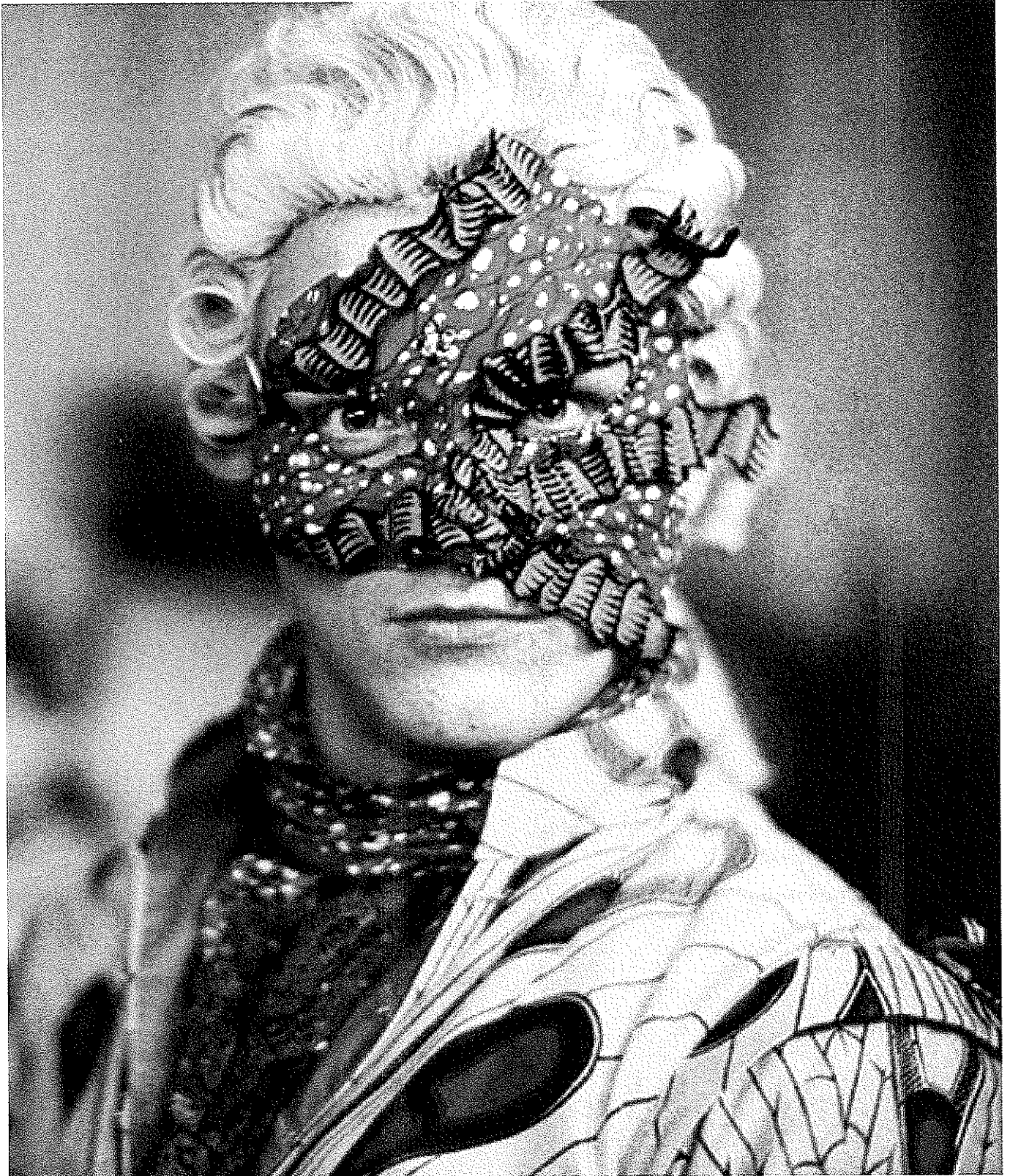
Un Ballo in Maschera (A Masked Ball), 2004, color digital video, 32-minute loop.