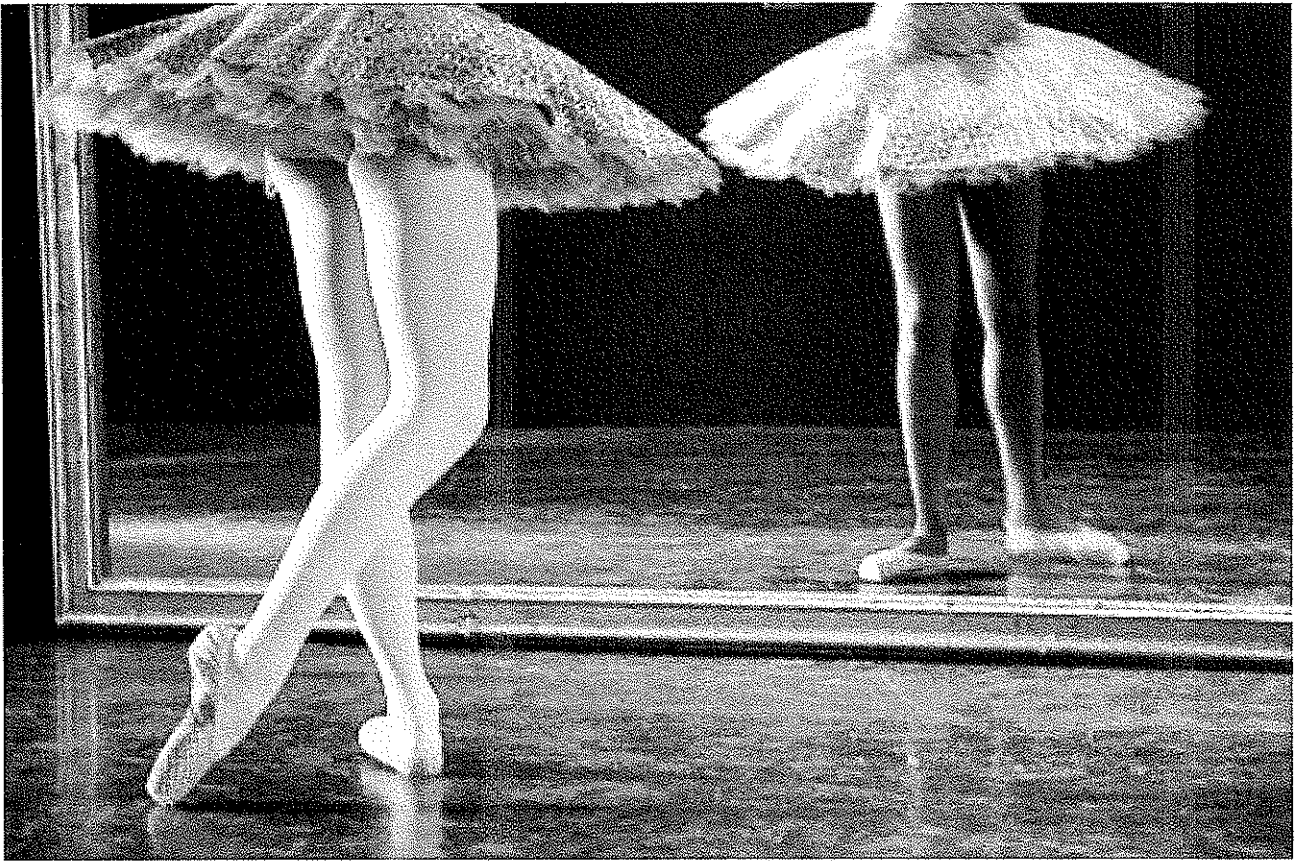
Odile and Odette, 2005, color film.

The work Odile and Odette becomes a significant metaphor for the colonial and cultural relationship of the Royal Opera House and the Africa Center, which geographically are in close proximity (both are situated at Covent Garden in London). The black ballerina may represent the African Center, while the white ballerina represents the Royal Opera House. Both institutions relating to the other - the Africa Center exists as a result of England's encounter with Africa, whilst the Royal Opera House worked in cooperation with Yinka Shonibare and the Africa Center to produce Odile and Odette . And like Odile and Odette both institution reflect something of the other, the Royal Opera House is not entirely Western, while the Africa Center is not entirely African. What is interesting to note is the role that Yinka Shonibare plays in this relationship. He represents the objective mirror that reflects what it receives to the general public, providing an impartial platform for the audience to view and decide. And this is what makes Yinka Shonibare the epitome of both